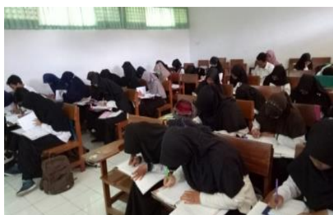
Figure 2. Evaluation activity

Furthermore, Figure 2 shows a picture of the students' activity when working on the assignment. It was seen that all students were serious in doing the cursive handwriting assignments.