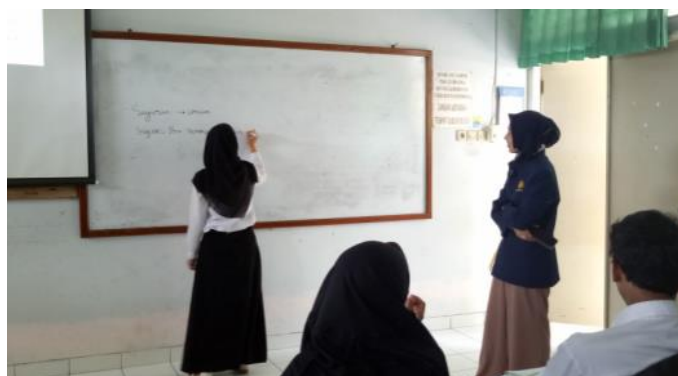
Figure 3. Answering question activity

Finally, Figure 3 illustrates when the students have the opportunity to answer the lecturer's questions. Students are asked to come forward and write their answers on the board using upright letters.