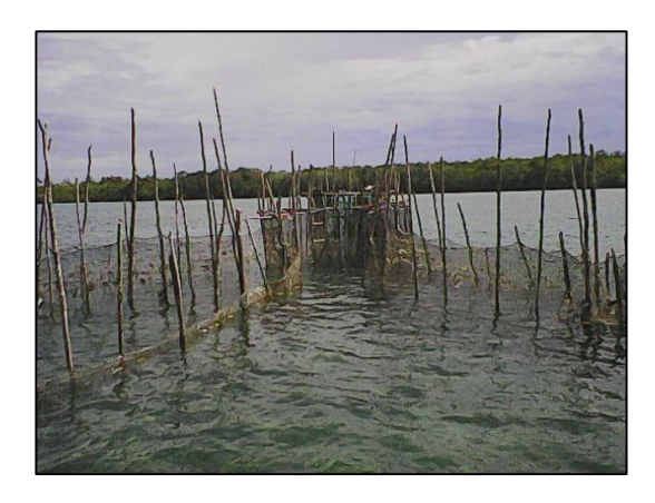
Figure 1. Illustration of the vean as a traditional fishing tool

A local wisdom that has been maintained for generations in Maluku is a vean, coming from Ohoi Disuk in the Kei Islands. Vean is a tool used to catch fish in traditional way. The vean illustration can be seen in Figure 1. The substance of vean in the Kei Islands is the same as sero in other areas functioning as a traditional fishing tool. The difference between vean and sero are in the form, materials used, and ways of making. Vean resembles a human who has head, neck, hands, mouth, and tongue. It is based on the idea that humans, flora, fauna, and the environment are a unity like the human body with its limbs. Everything is interrelated and interconnected. Earth is an ecosystem, where the amount of organism life is integrated, united, and interconnected [14]. The advantage of using vean as a fishing tool is that it does not cause damage to the marine ecosystem and maintain the sustainability of marine life because the materials used to make the vean are from local materials such as wood, bamboo splits, and coconut leaves.