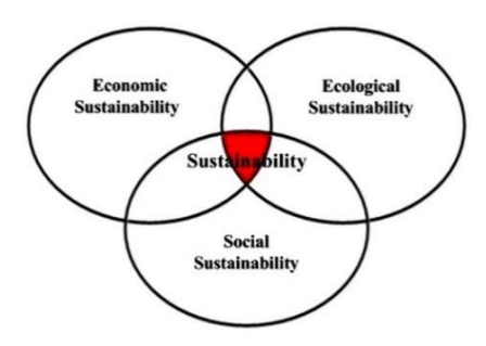
Figure 4.Sustainability triangle/diagrams showing the three overlapping components of sustainability (redrawn [23])

Vean is as a part of cultural institution in Maluku, especially for the customary people in Ohoi Disuk, in the utilization and management of biological natural resources and marine biota. Vean is not only used to meet the economic needs, but also to preserve the continuation of marine life and human life as supporters and to create a harmonious social life. In the view of local community, the marine ecosystem is the pulse of human life because the sea is the source of life and plays a role in improving the economy of the community. Thus, the sea must be protected [13]. Vean is a concrete form of efforts by customary people in protecting the marine ecosystem. People believe that the marine ecosystem has a number of very large role in supporting sustainable living for the lives of customary people and their supporting environment in the circle of sustainability. Figure 4 shows the sustainable living model is a nest model that covers economic, social, and ecological fields [23].