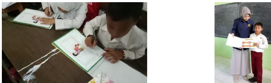
Figure 3. Learning activities with scrapbook of child stories

The data obtained in this study were the results of the storytelling skills test aimed at grade II students. The test is carried out in two stages, namely pretest and posttest. Pretest is given to students before students get treatment, while posttest is given after students carry out the learning using scrapbooks of child stories media. The research data was taken to determine the differences in the control class and the experimental class. The control class is a class that follows learning without using scrapbook of child stories media, while the experimental class is a class that takes part in learning activities using scrapbook of child stories media. Table 1 displays the descriptive statistics of the control class and experimental class at the pretest stage.