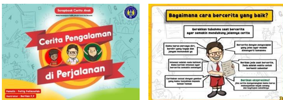
Figure 2. Design scrapbook of child stories

The scrapbook of child stories contains Indonesian language teaching materials especially story writing and storytelling materials for grade II students of elementary school. The scrapbook of child stories referred to the teaching objectives, Curriculum 2013, standard of competence, core competence, basic competence, indicators of learning, and teaching materials. The innovation developed by adjusting the components and learning objectives. Arranging the content according with the objectives will have a good effect [22]. The scrapbook of child stories consists of several parts, including the introductory part, content part, final part, and closing part. Consist of the scrapbook based on the literature study conducted. Scrapbook child stories a media for learning storytelling referring to concept of innovation, functioning of the innovation, its benefits, and its meaning [23]. The learning materials are presented with illustration and pictures interesting to creating learning activity enthusiastic for students. The Figure 2 are the cover design and material contained on scrapbook of child stories. The title used is an adjustment to the learning theme and goal as well as the material presented. In the Figure 3, there are some pictures of learning activities carried out using scrapbook of child stories.