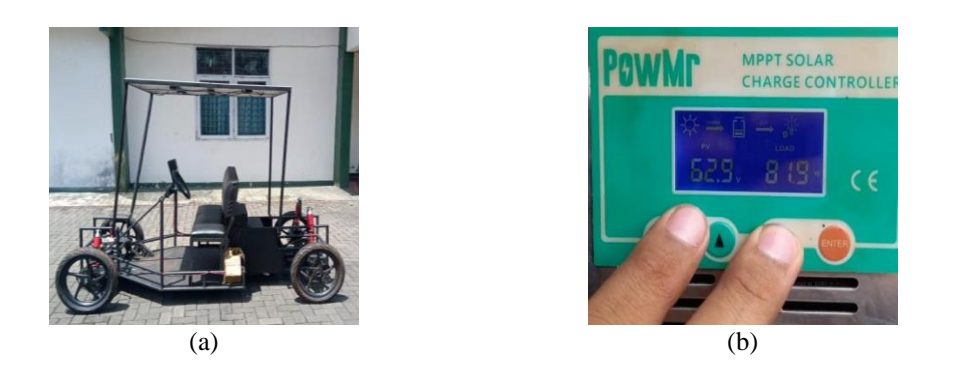
Figure 2. Components of electric car (a) solar-powered electric car prop and (b) information panel energy stored in batteries from solar panels

This stage includes creating resources and activities in compiling programs or application readiness [30]. At this stage, the production of electric cars is carried out according to the designs that have been prepared. The electric car that has been produced can be shown in Figures 2(a) and 2(b). Figure 2(a) shows the complete electric car, while Figure 2(b) depicts the energy stored from the solar panels. After the electric car is built, limited trials are carried out to ensure that the electric car can be used and there are no problems. The results of this trial found several obstacles, including the microcontroller and the motor, which get hot quickly after being used for 10 minutes. In addition, damage to the electric motor teeth was found, causing it to slip when used. Several improvements were made from the results of this trial, including repairing the microcontroller's electrical components and replacing the motor's gears by changing the reinforcing bolts.