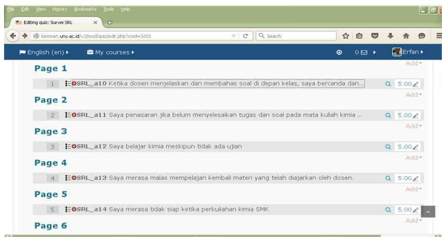
Figure 1. The Example of Statement in the SRL Questionnaire

a negative statement, the Always (SL) answer has the lowest score (1) and so on. The example of statements in the SRL questionnaire was shown in Figure 1.