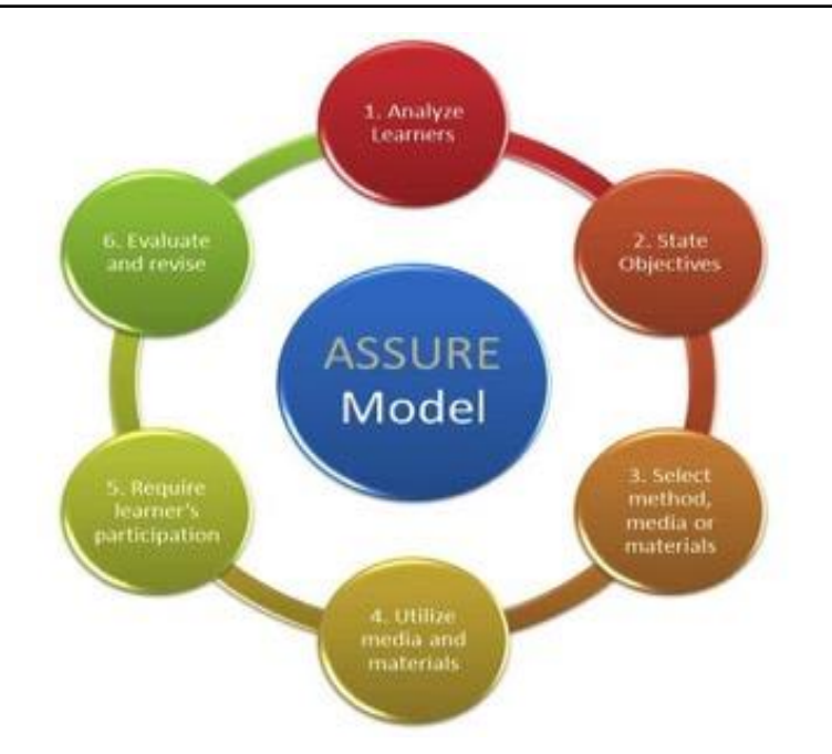
Figure 1. Development model of ASSURE