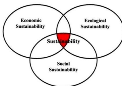
Figure 4. Sustainability triangle/diagrams showing the three overlapping components of sustainability (redrawn [23])

Vean is as a part of cultural institution in Maluku, especially for the customary people in Ohoi Disuk, in the utilization and management of biological natural resources and marine biota. Vean is not only used to meet the economic needs, but also to preserve the continuation of marine life and human life as supporters and to create a harmonious social life. In the view of local community, the marine ecosystem is the pulse of human life because the sea is the source of life and plays a role in improving the economy of the community. Thus, the sea must be protected [13]. Vean is a concrete form of efforts by customary people in protecting the marine ecosystem. People believe that the marine ecosystem has a number of very large role in supporting sustainable living for the lives of customary people and their supporting environment in the circle of sustainability. Figure 4 shows the sustainable living model is a nest model that covers economic, social, and ecological fields [23].