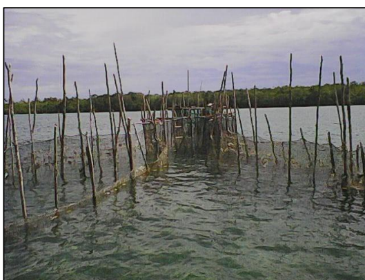
Figure 1. Illustration of the vean as a traditional fishing tool

A local wisdom that has been maintained for generations in Maluku is a vean, coming from Ohoi Disuk in the Kei Islands. Vean is a tool used to catch fish in traditional way. The vean illustration can be seen in Figure 1. The substance of vean in the Kei Islands is the same as sero in other areas functioning as a traditional fishing tool. The difference between vean and sero are in the form, materials used, and ways of making. Vean resembles a human who has head, neck, hands, mouth, and tongue. It is based on the idea that humans, flora, fauna, and the environment are a unity like the human body with its limbs. Everything is interrelated and interconnected. Earth is an ecosystem, where the amount of organism life is integrated, united, and interconnected [14]. The advantage of using vean as a fishing tool is that it does not cause damage to the marine ecosystem and maintain the sustainability of marine life because the materials used to make the vean are from local materials such as wood, bamboo splits, and coconut leaves.